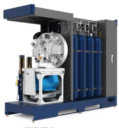
> UNICUS<sup>®</sup> 4i (SHOWING INSIDE BACK)

> UNICUS<sup>®</sup> 4i (SHOWING INSIDE FRONT)